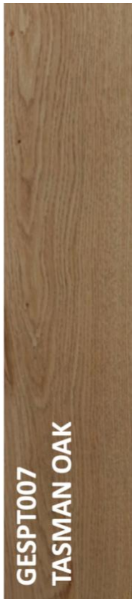
GESPT007 TASMAN OAK