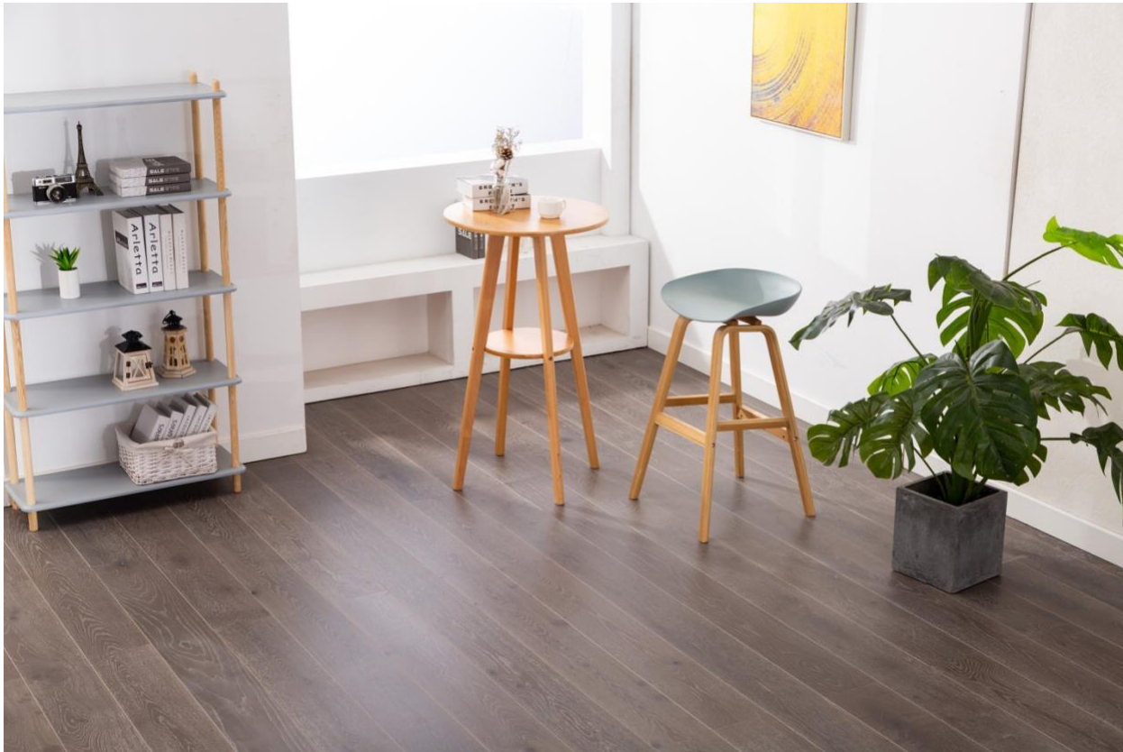
GESPT004 LATTE OAK