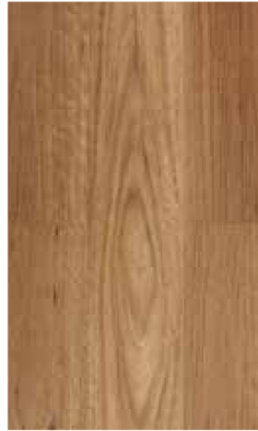
New England Blackbutt