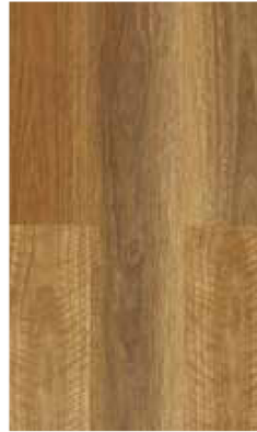
NSW Spotted Gum