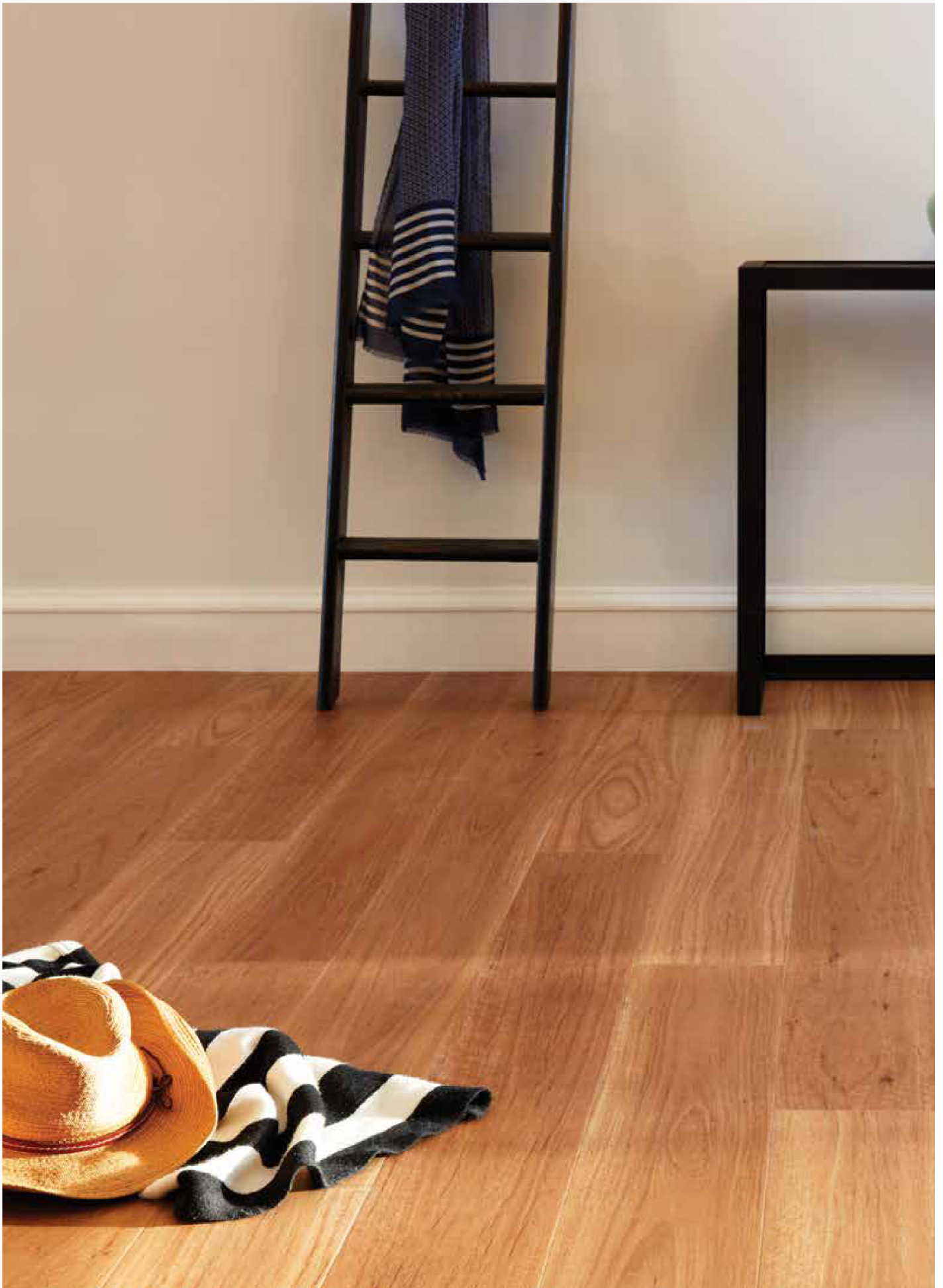
Front Cover Colour: Pale Gorge