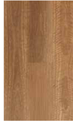
QLD Spotted Gum